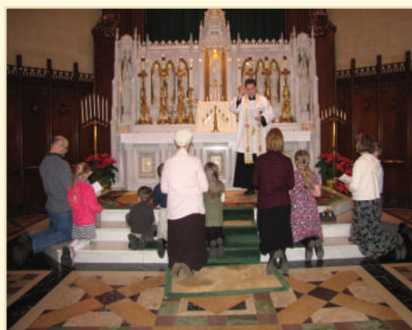
Right side of the child is vacant to indicate the presence of the Guardian Angel